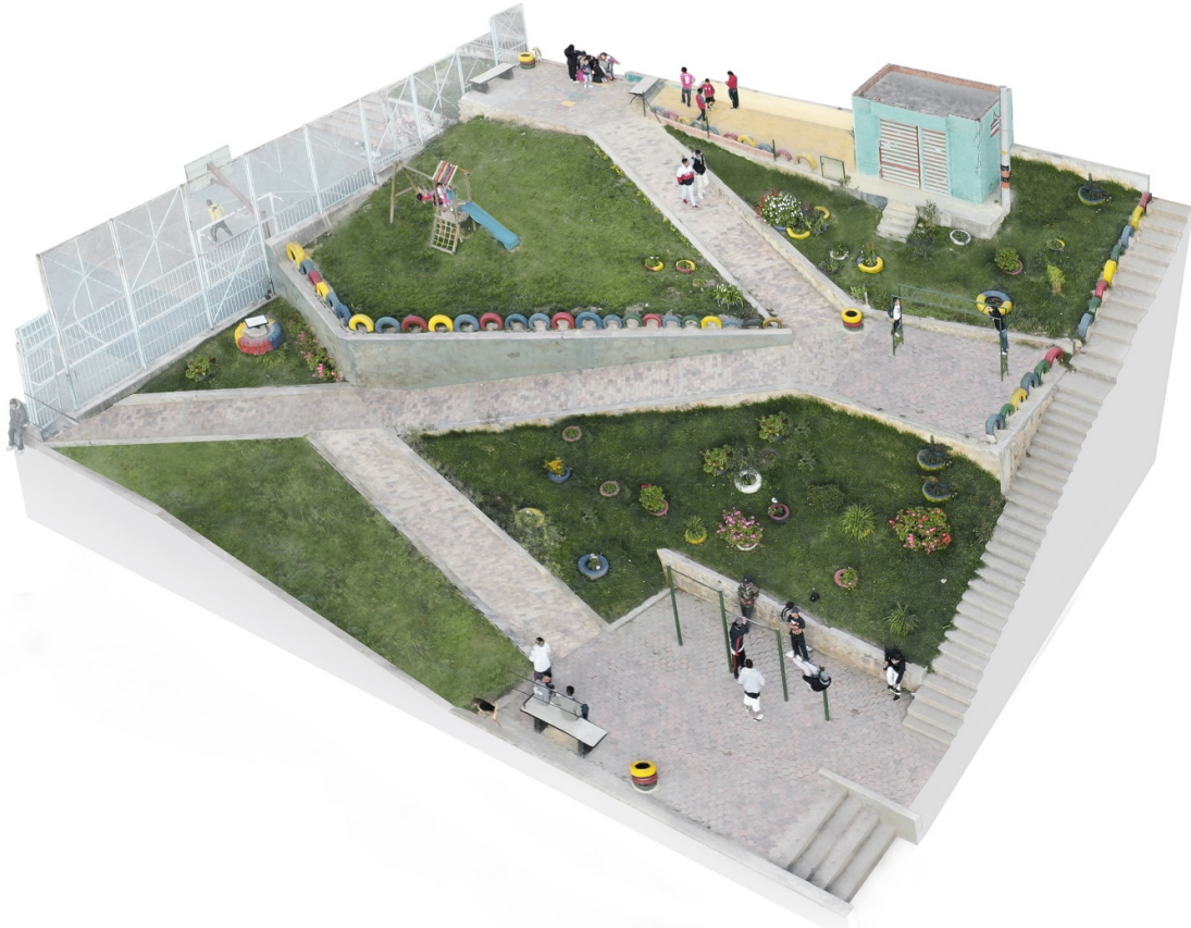
Figure 2. Axonometric visualization that has superimposed a photograph over the three dimensional representation.