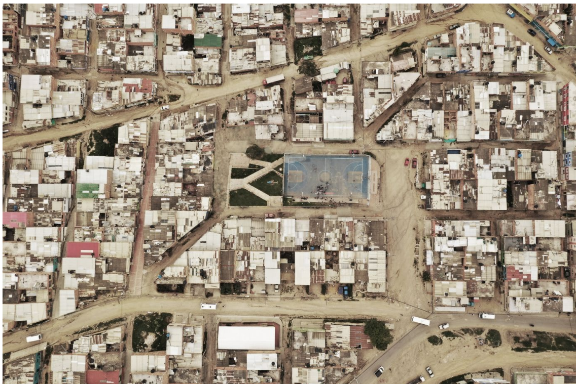
Figure 3. Aerial photograph that shows where Zig Zag Park is sited in Ciudadela Sucre.